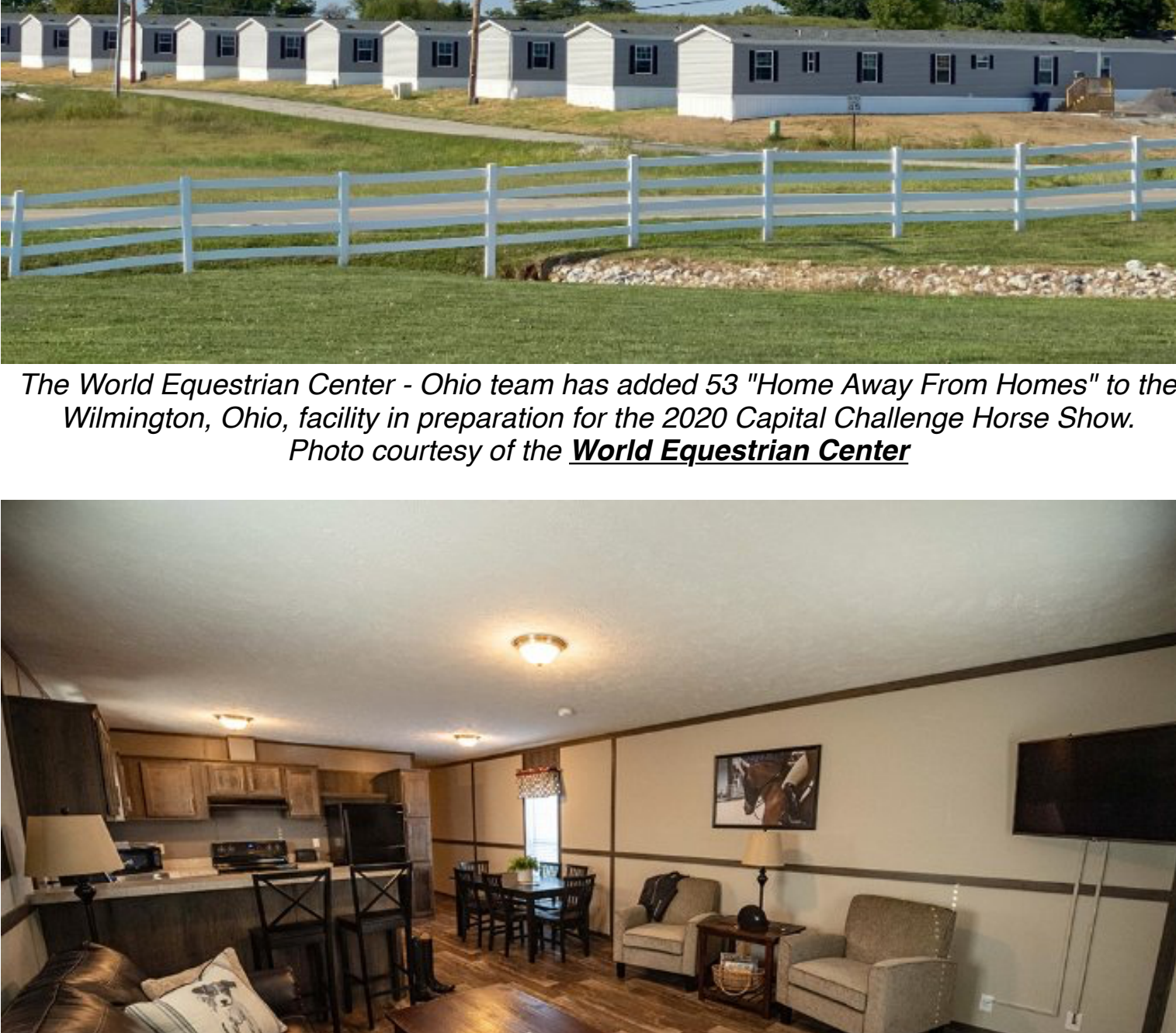
The World Equestrian Center - Ohio team has added 53 “Home Away From Homes” to the Wilmington, Ohio, facility in preparation for the 2020 Capital Challenge Horse Show.

In preparation for hosting the year-end finale horse show, the World Equestrian Center team has accelerated their work plan, adding 53 “Home Away From Home” units to the facility, as well as installing Dutch doors in each stall of two of the main barns, expanding the horse trailer parking area, adding additional RV camp sites, and more.