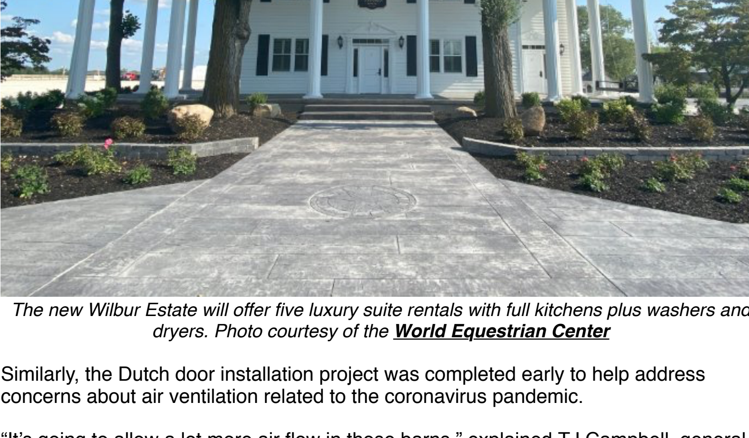
The new Wilbur Estate will offer five luxury suite rentals with full kitchens plus washers and dryers.

The Capital Challenge Horse Show will also mark the debut of the World Equestrian Center’s Wilbur Estate, which will offer five luxury suite rentals. The addition of the new lodging options was slated to be completed in the coming months, but the World Equestrian Center’s staff jumped into action to move the projects forward in advance of Capital Challenge. With the addition of the 53 new units, the facility now offers 125 total two- and three-bedroom “Home Away From Homes.”