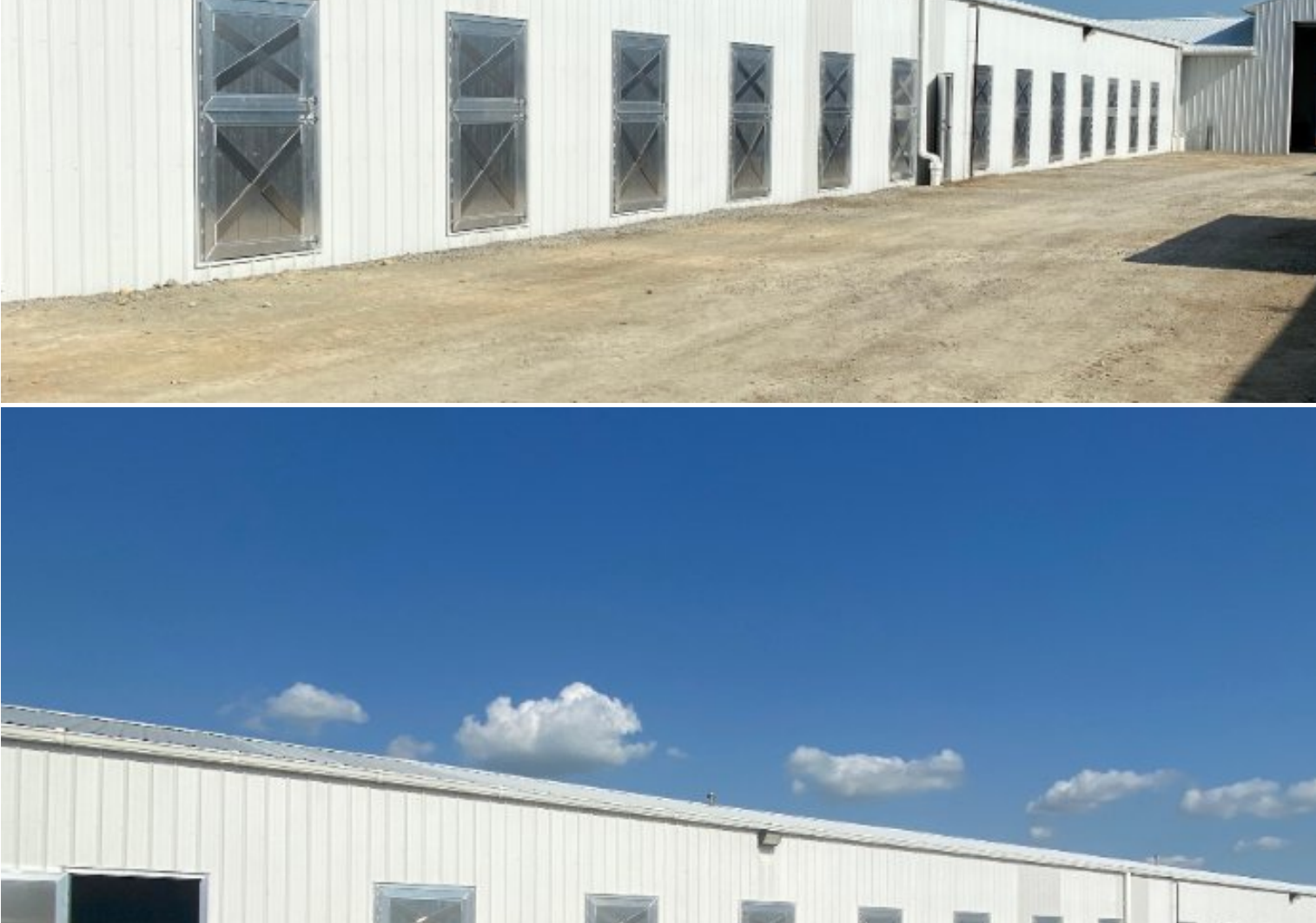
Dutch doors installed in two of the barns.

“It’s going to allow a lot more air flow in those barns,” explained TJ Campbell, general manager of the World Equestrian Center – Ohio. “With the Dutch doors, the horses will be able to stick their heads out the window, and for people who may not want to walk down the aisle way, they can walk a horse in and out from the outside of a good number of the stalls without having to actually go in the barn.”